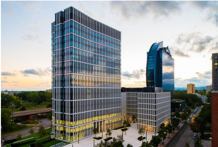
Fig. 1: The St. Martin Tower, comprising a wing-shaped tower and a U-shaped wing, heralds the start of a new era of office architecture in Frankfurt am Main.