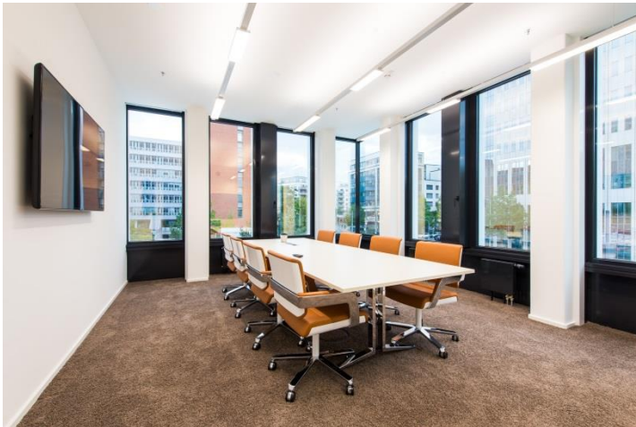
Fig. 4: Energy efficiency is equally important: LUXMATE LITENET does the job, using nearly invisible track-mounted presence detectors and a daylight measuring head installed on the roof.