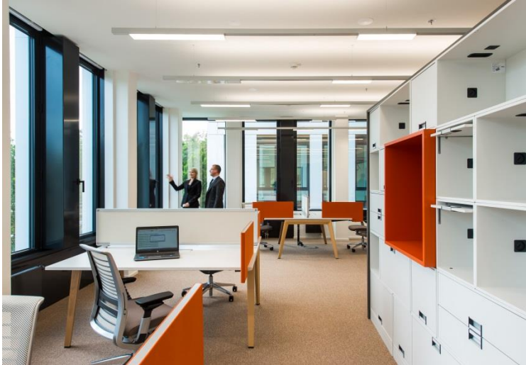
Fig. 3: Either three or five of the SEQUENCE track LED modules, which are only 25 mm in height, can be mounted on the suspended tracks, as required.