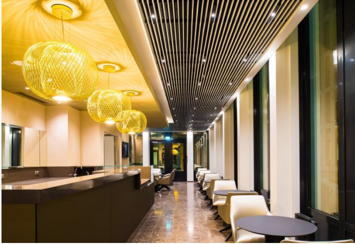
Fig. 5: The interior design of the Tower's restaurant area with its clear stylistic idiom is reminiscent of a contemporary hotel lounge rather than of a conventional staff canteen.