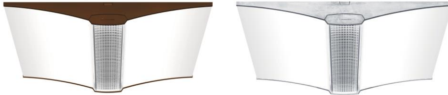
Image 3 + 4: The office bestsellers MELLOW LIGHT, VAERO, ONDARIA and LIGHT FIELDS evolution are now available in the colours white, black, silver, bronze and raw.

Image 1 + 2: Zumtobel presents four office luminaires with a new variety of colours and offers lighting designers even more creative freedom in the future.