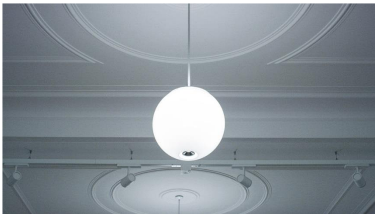
Fig. 2: Giving rooms a sense of scale – that is exactly what ALVA can do. This fitting can discretely fade into the background or present itself as a distinctive object to match the particular situation.